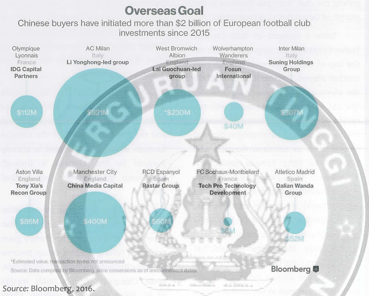
Picture 2. China's investment to the European Football Clubs since 2015.